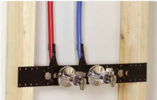
ProPEX Out-of-the-Wall Support System