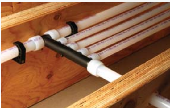
EP Multi-port Tee