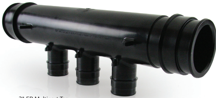
2" EP Multiport Tee