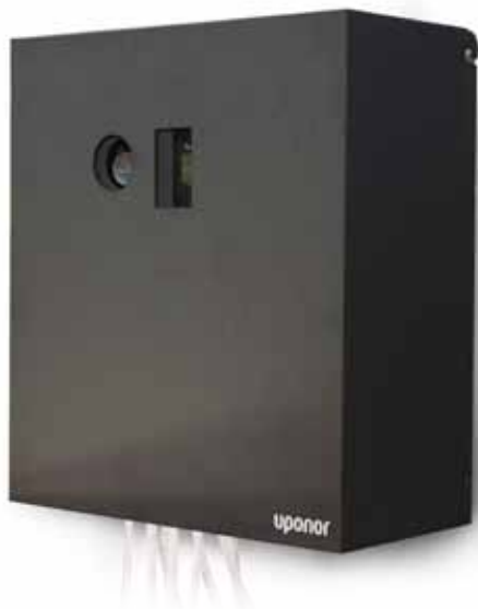
Radiant Ready 30E™