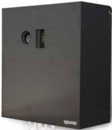
Radiant Ready 30E™