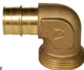
ProPEX Manifold Elbow Adapter