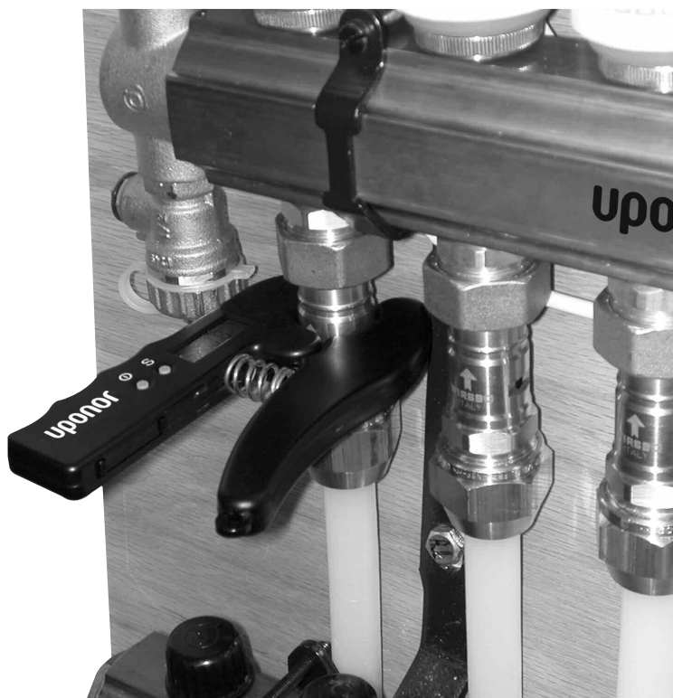
Figure 3: FlowMaster Jr. Attached to Flow Meter Nipple