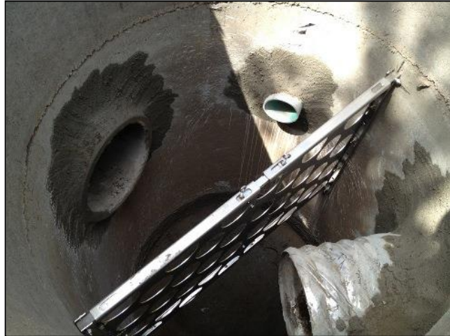
The SAFL Baffle is a cost-effective method to help cities treat urban runoff that goes into storm sewers and eventually ends up in lakes, rivers and oceans.

One of Upstream Technologies’ products to make waterways clean in an affordable way is the SAFL Baffle. Developed out of the University of Minnesota College of Science and Engineering’s St. Anthony Falls Laboratory (SAFL), this product keeps sediment pollution out of lakes, rivers and oceans.